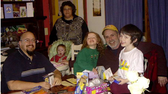
Getting care packages ready for January's outreach to prostitutes in north Minneapolis.