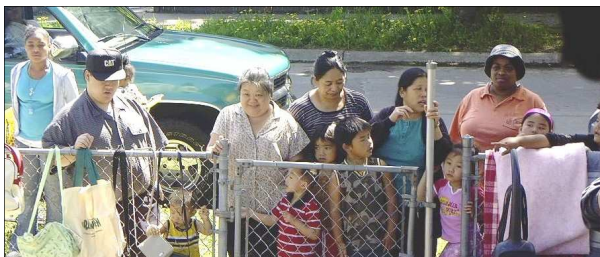
Waiting for the giveaway to open