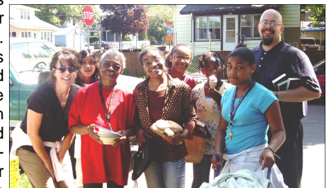
Some of our returning "shoppers"