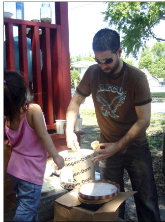
Serving up scoops

Several brothers and sisters joined us to serve at